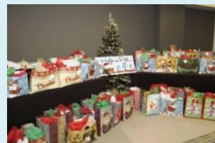
Help a Pet – Get a Gift