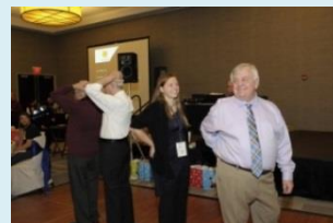
Heads or Tails