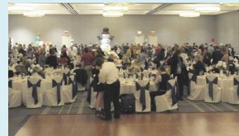
The crowd - 340 dog and cat lovers