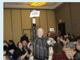
Bidding to raise money for kennel improvements