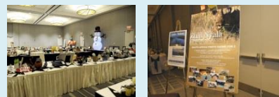
Over 250 auction Items